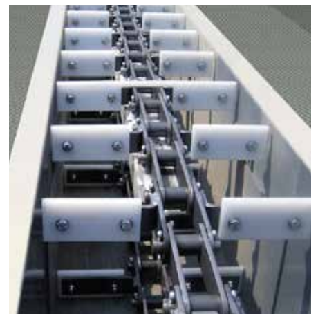
Not binding, subject to change. Version 2017 / 1.1

Chutes and vibration chutes, chain conveyor base plates, crushers, conveyor belt supports and scrapers, stone drums, road construction machinery, coal and ore processing systems etc.