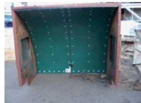
Elevator head / spout