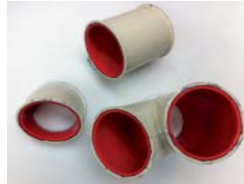
Pipe & bends