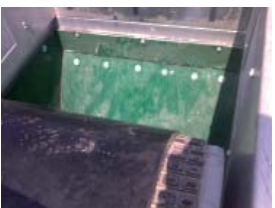
Product overshoot area