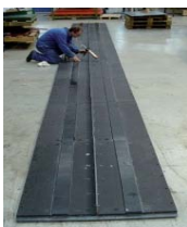
Bottom and side wall for chain conveyor