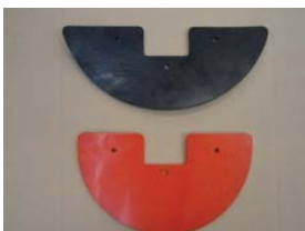
Flights for drag conveyor