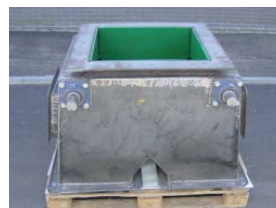
Flop-gate / transfer housing

MBS Liège is supplying with great success Kryptane® polyurethane liners as a replacement for rubber, polyethylene (PE500 & PE1000) or steel wear liners.