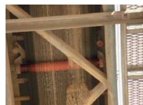
Conveyor belt idler